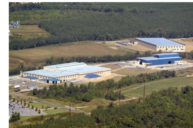
Patriot Centre Industrial Park, one of Martinsville-Henry County's existing sites is the future home of RTI International Metals.

The Commonwealth Crossing Business Centre is Martinsville-Henry County's only potential for a large-pad, rail-served industrial park meeting advanced manufacturing and global supply-chain needs. Situated on U.S. Highway 220 and bordering Rockingham County, North Carolina, the site is approximately 30 miles north of Greensboro's Piedmont Triad International Airport and its co-located FedEx distribution hub. Over seven million dollars in local funds from a diverse collection of local partners has been committed in Commonwealth Crossing for land acquisition, master planning, engineering and wetlands delineation, water and sewer extension, and development of broadband telecommunications capacity.